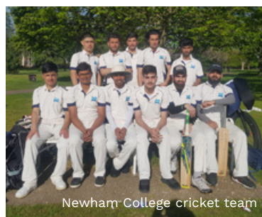
Newham College cricket team

Newham College cricket team has also won the London Further Education indoor Cricket League.