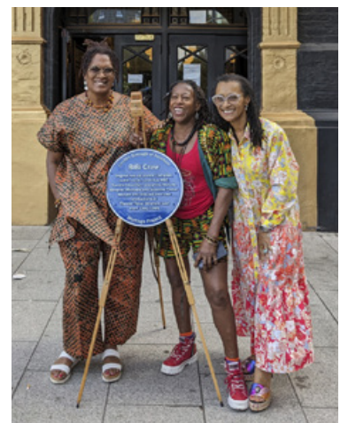
Beverley Michaels, Judith Jacob and Suzanne Packer

For my own part, as the Creative Director for this event, I'm proud that the BiBi Crew have received their own Newham