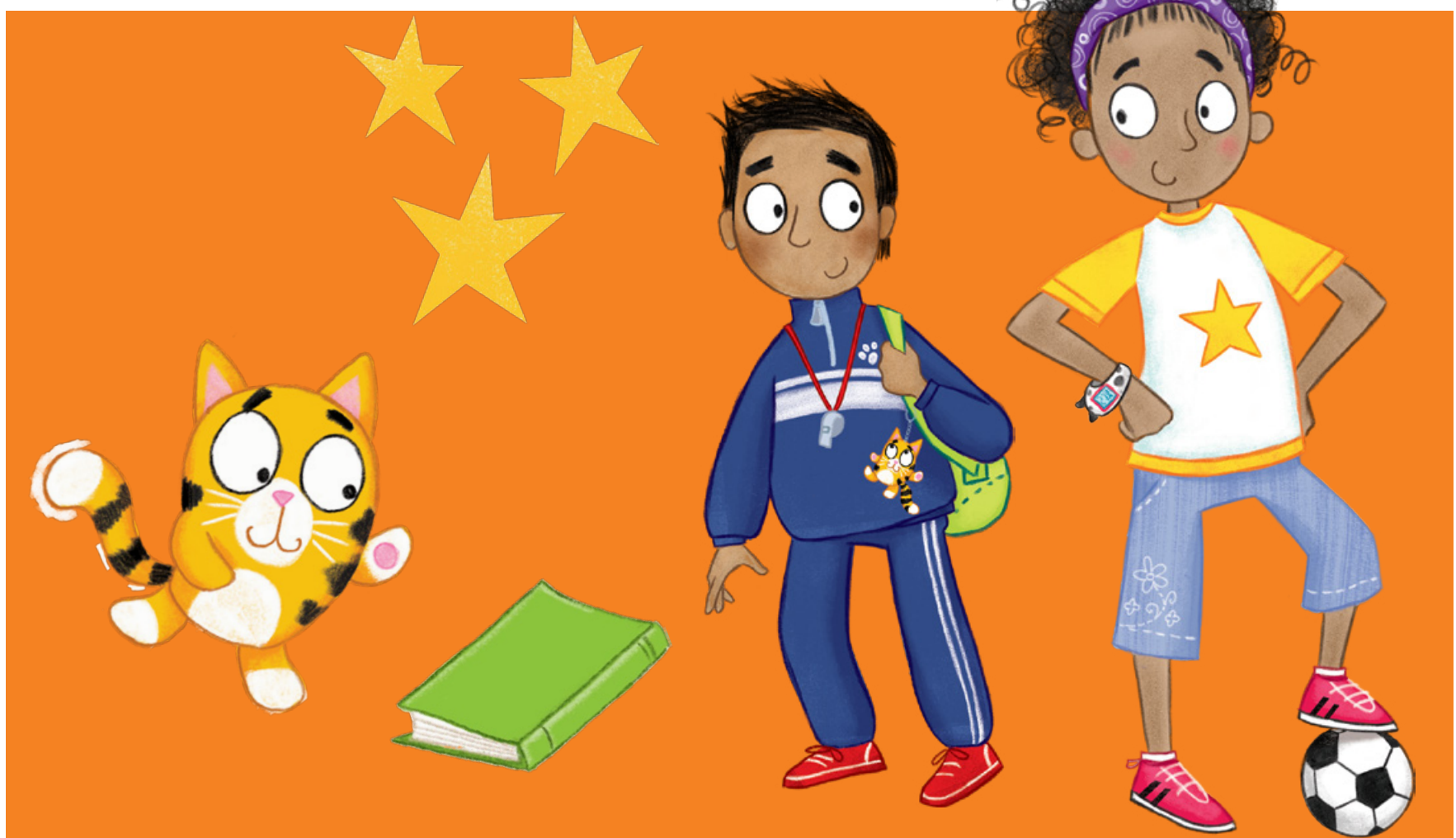
Illustrations by Loretta Schauer and © The Reading Agency 2023

The Summer Reading Challenge is here again in your local library, for children of all ages during the summer holidays. This year's theme is focused on reading, sport and play. Children will be able to join a superstar team and their marvellous mascots as they navigate a fictional summer obstacle course and be rewarded with free incentives including stickers.