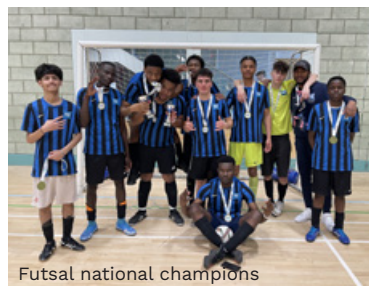
Futsal national champions

Newham College are the Association of Colleges National Futsal champions after a resounding 23 - 6 win against a talented Exeter college team! Following the 2021-22 season win, the Futsal men's team topped the league comfortably while scoring an exceptional 93 goals in 7 games.