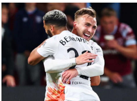
Bowen celebrates.

The hardest goal for any striker to score is when you have time to think – after all, the instinctive header, touch or volley are second nature.