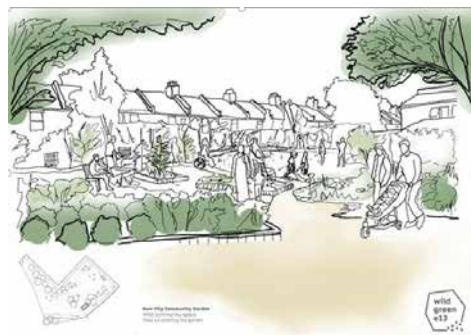
Wild Green E13

Second place went to a project to improve the Greenway Orchard by providing three benches situated both in the orchard and on the greenway itself; creating a possible picnic area; play equipment to attract more family engagement including touch,