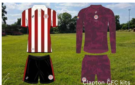
Clapton CFC kits