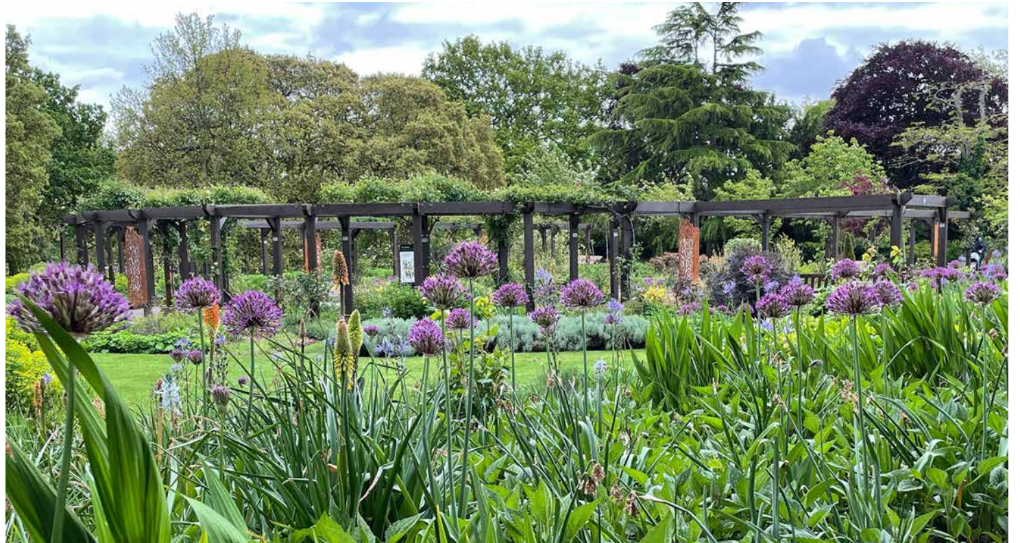
The flower garden above is the park showpiece, one of the features that has been a magnet to thousands in Newham.

He also argues that because the site is within the park it cannot be seen as a “brownfield” site. The National Planning Policy Framework excludes “land in built-up areas such as residential gardens, parks, recreation grounds and allotments” from being